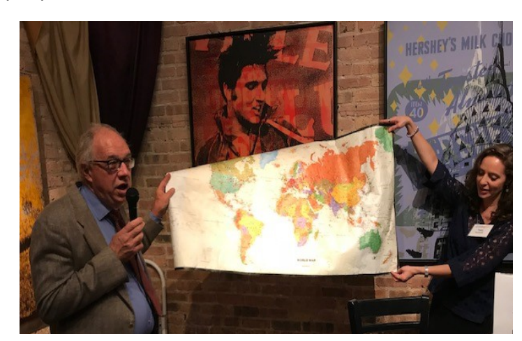
Thank you to all 2018 homestay hosts!