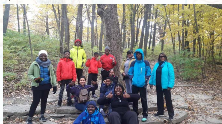
Thank you to all 2018 volunteers!